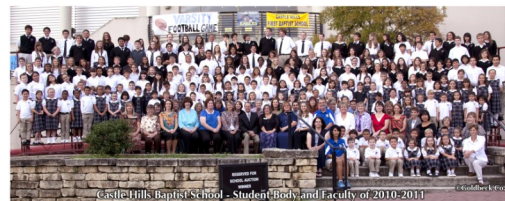
Castle Hills Baptist School - Student Body and Faculty of 2010-2011

All students should come in chapel dress on Friday, August 26, for our school-wide panoramic picture day. A picture package of two panoramic pictures (one large and one small panoramic picture) will be available for purchase for $30. Students desiring to purchase the picture package should complete the attached order form and return the order form and money to the Front Office on Friday, August 26.